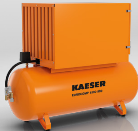
Image: EPC 1500-500