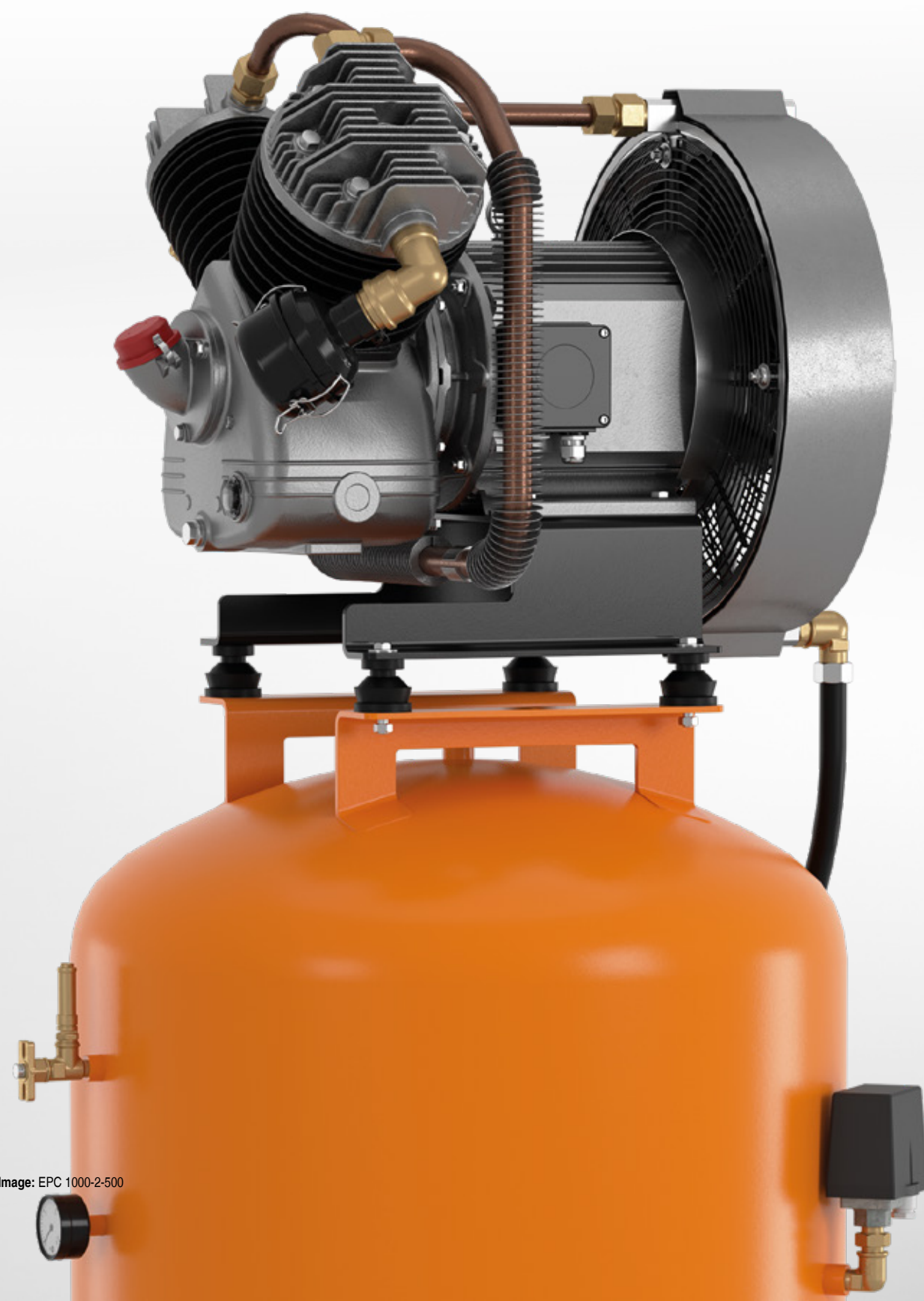
Image: EPC 1000-2-500